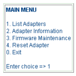
Figure 2: Main Menu

1. Start Iputil. The Main Menu is displayed.