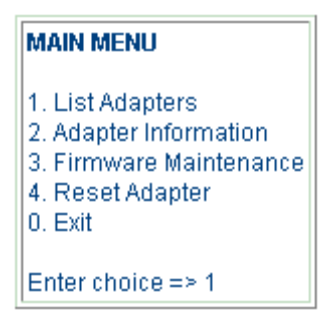
Figure 1: Main Menu

Iputil starts and the Main Menu appears.